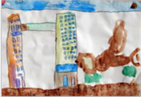
Hugh, G1: My House

The QISS Book Fair is October 15 & 16. The Stars Book Importer from Beijing, the same as last year, will bring in a variety of titles and interest levels to sell on the spot. Please come to browse and purchase at your convenience. Keep in mind to bring a book bag with you, but if you wish to purchase a School Library Bag you can at the PAC corner. Snacks and coffee will be available for parents.