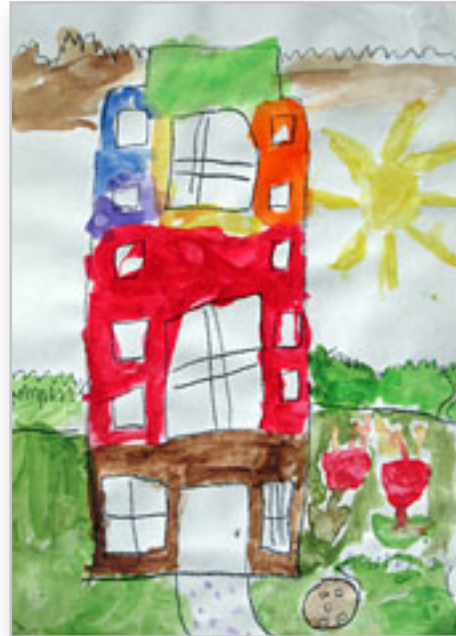
Chloe, G1: My House

Students are reminded that gum chewing is strictly prohibited in PE classes where swallowing gum unexpectedly while