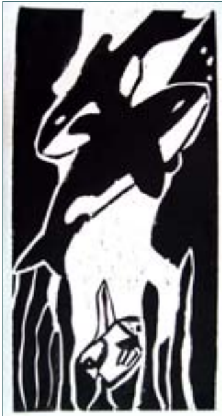
Jane, G7: Linoleum Block Printmaking

Learning to be appropriately assertive --- neither reacting passively nor aggressively -- is a skill we can help our kids learn. In the process, we can help them feel more competent and confident in themselves. When they are upset with their friends, their teachers, or with us as parents, we can guide them toward strategies and actions that will have the best chance of success. By not solving the problem for them, our children can learn that they can advocate for themselves and make a difference.