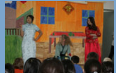
Cinderella in China

animal, plant, or combined forms, and taught the people of their laws and ceremonies.