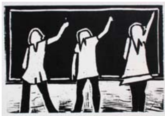
Casey, Grade 9: Woodcut Print